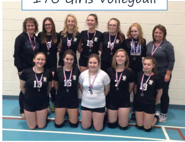
17U Girls Volleyball