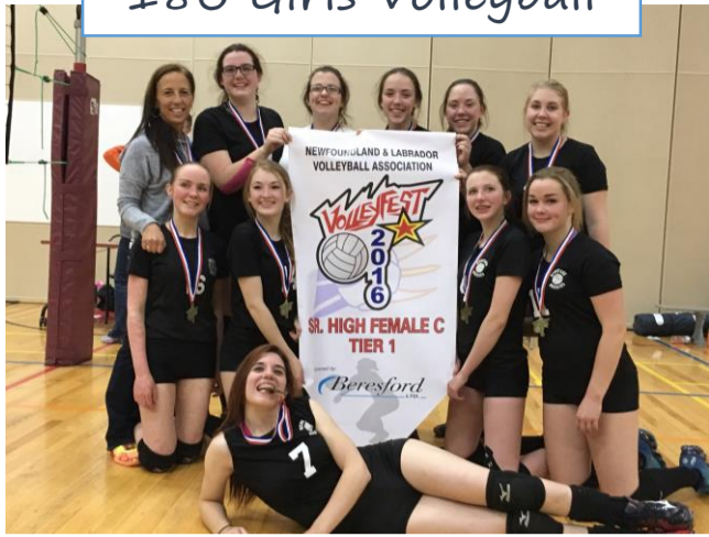
18U Girls Volleyball