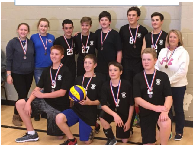
Junior Boys Volleyball